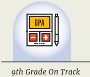
9th Grade On Track

1 Early and intentionally targeted interventions to reduce off-track students in the 9th grade.